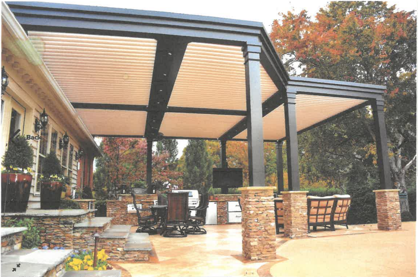
Knaak Design Group